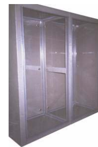
Non-Removable internal Gusset