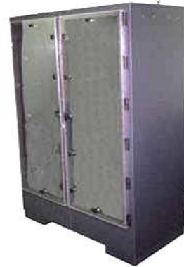
OPTIONAL Clear Lexan™ Doors